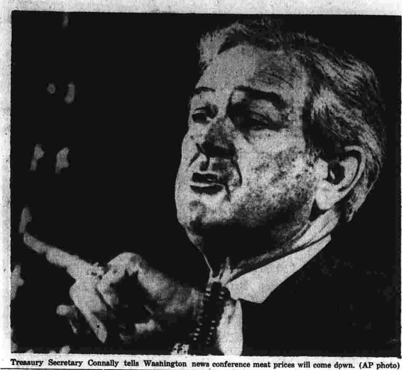
Treasury Secretary Connally tells Washington news conference meat prices will come down.

Meat Cost Outlook Down WASHINGTON (AP) — The Nixon administration has determined to make the Pay Commission presidential nominee, emerging from a Board and Price Commission nation, said that time might be food prices rising by 1.6 percent, the highest in 14 years.