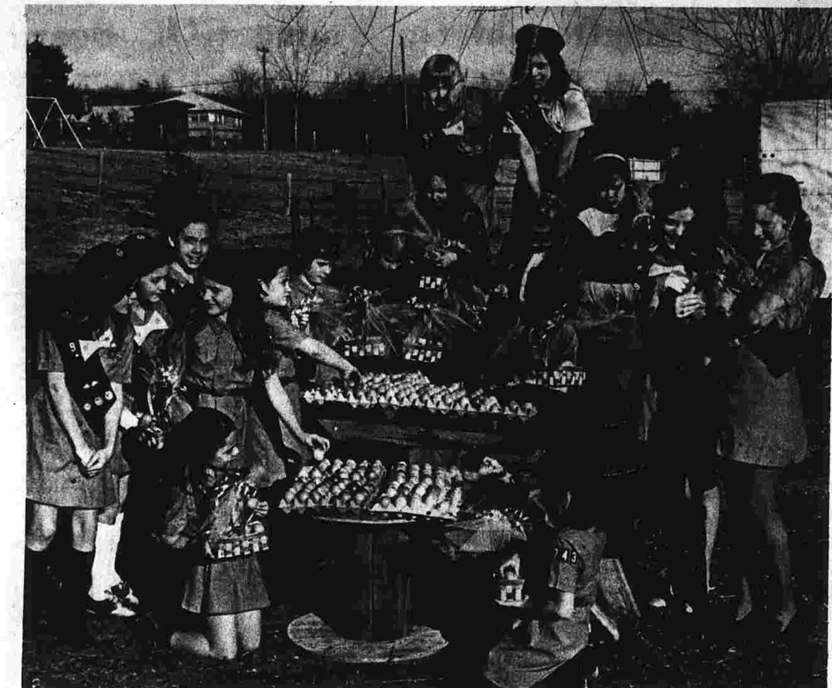
Bunny To Join in South Windsor Egg Hunt